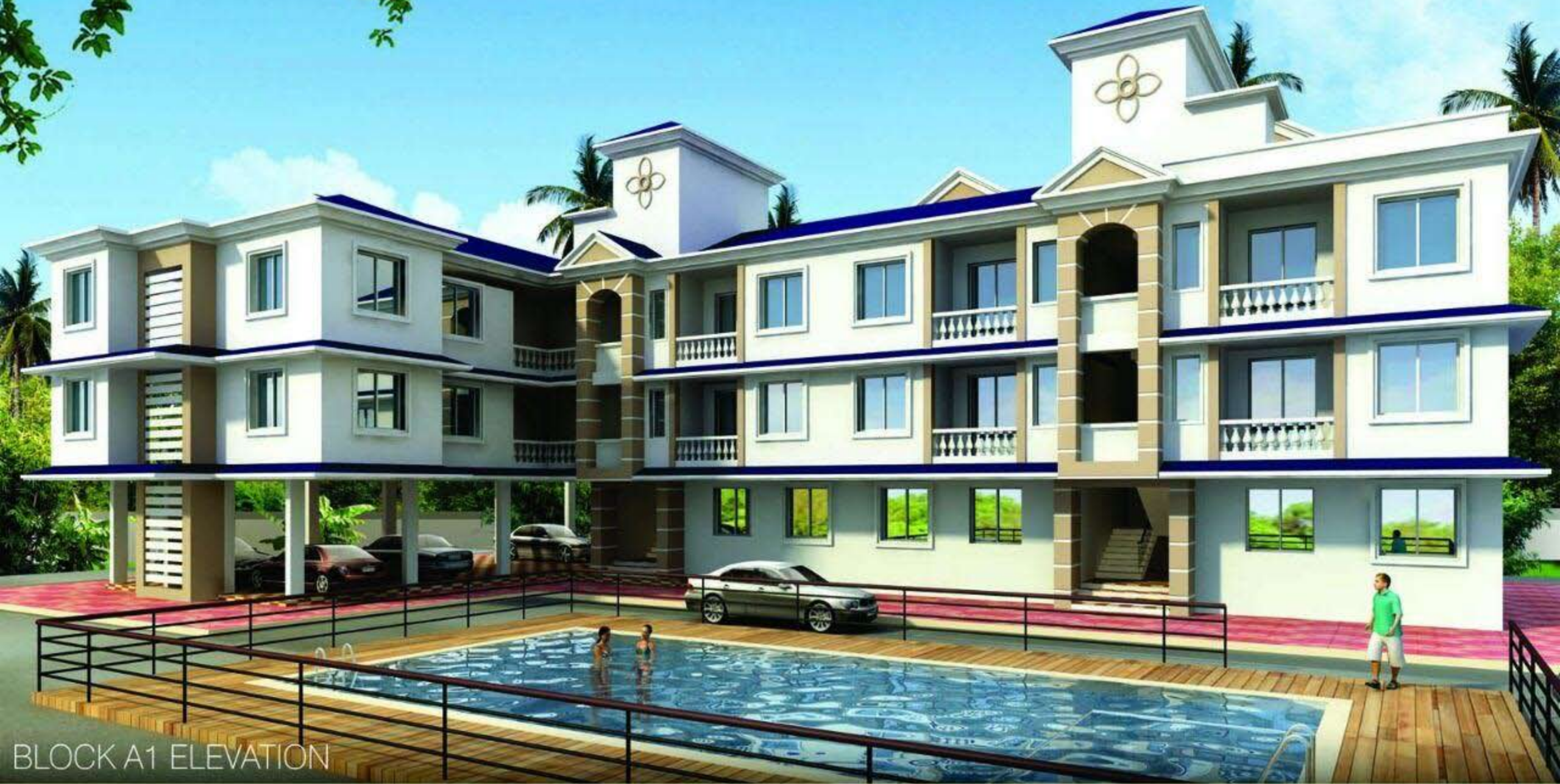
BLOCK A1 ELEVATION

Pool facing 2 Bedroom Apartments at Chaudi Wado, Marna, Siolim, Bardez - Goa