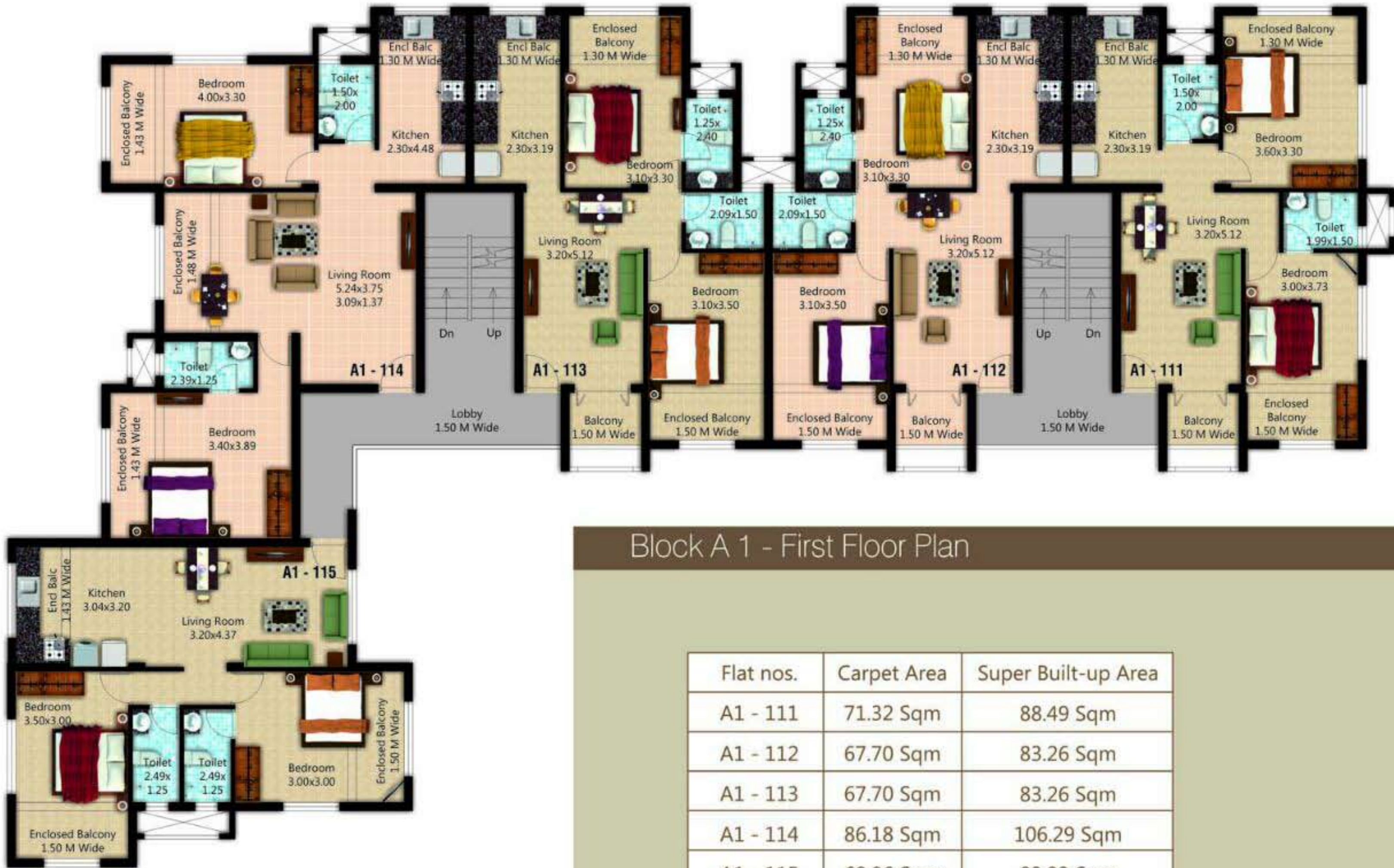
Block A 1 - First Floor Plan