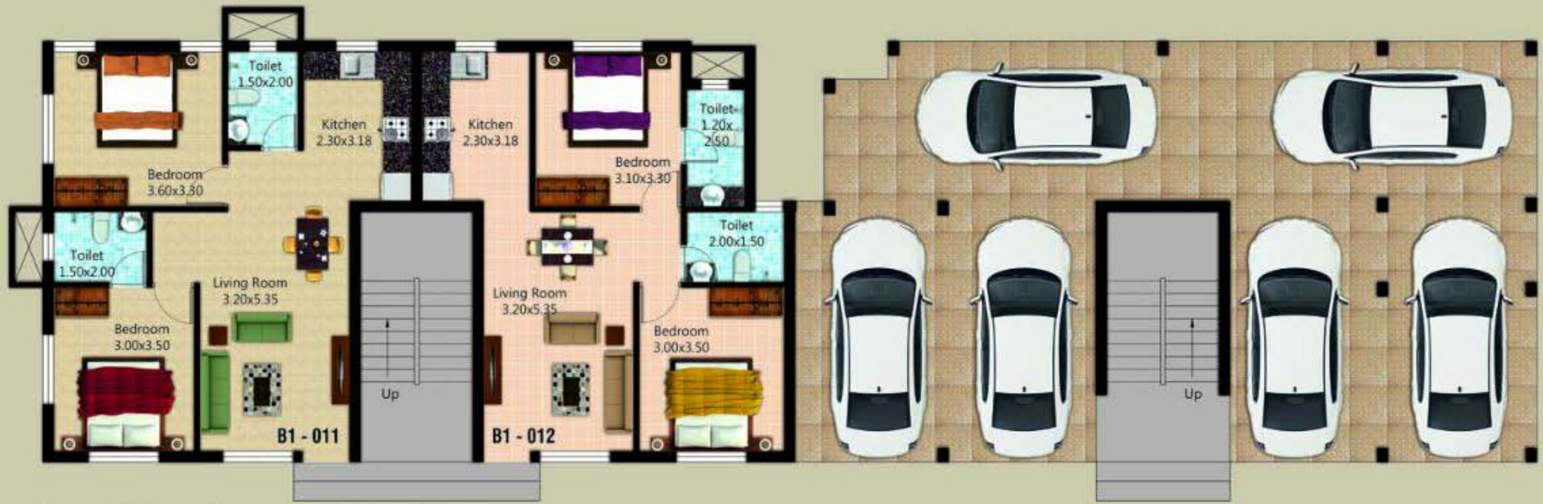
Block B1 - Ground Floor Plan