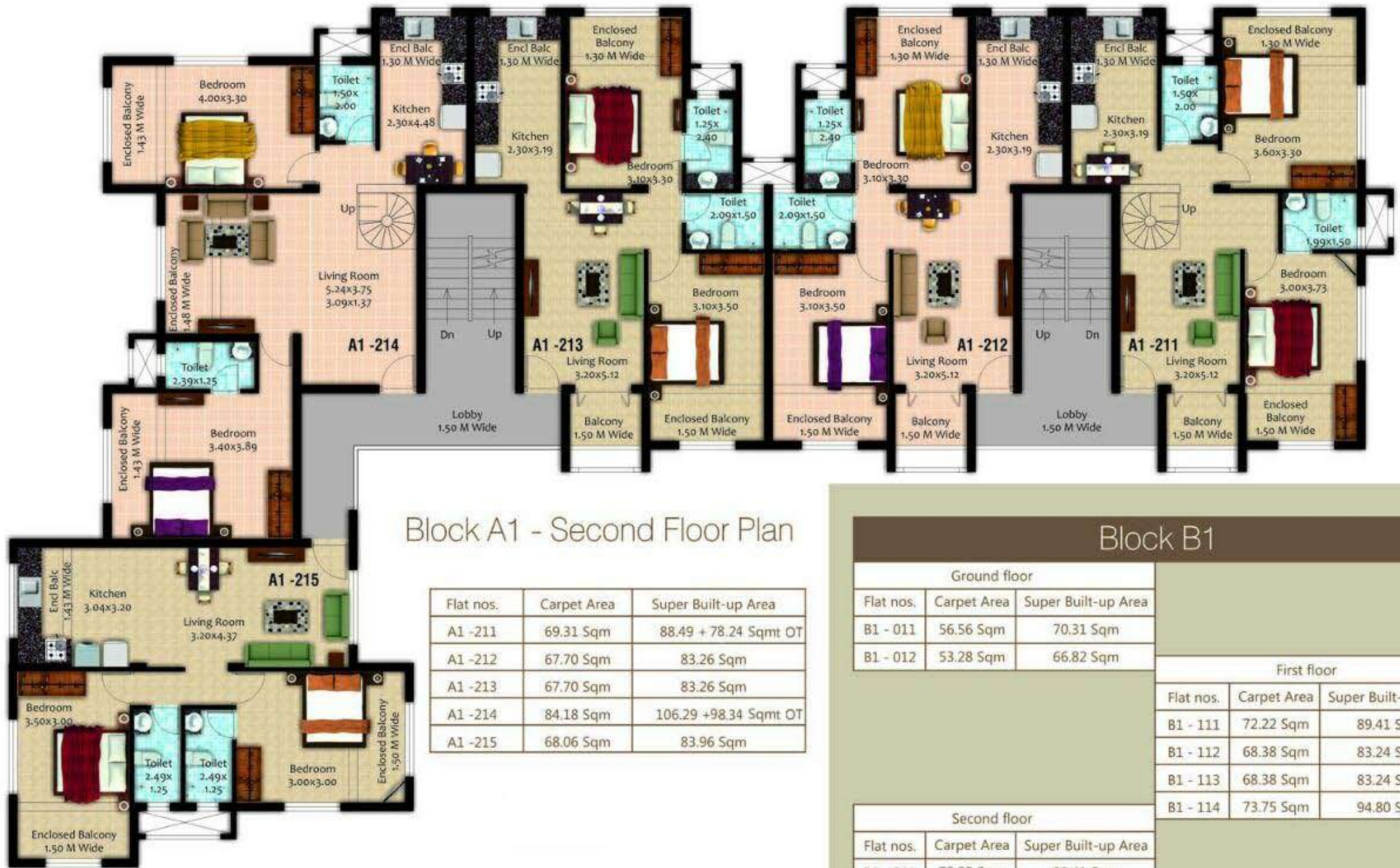
Block A1 - Second Floor Plan