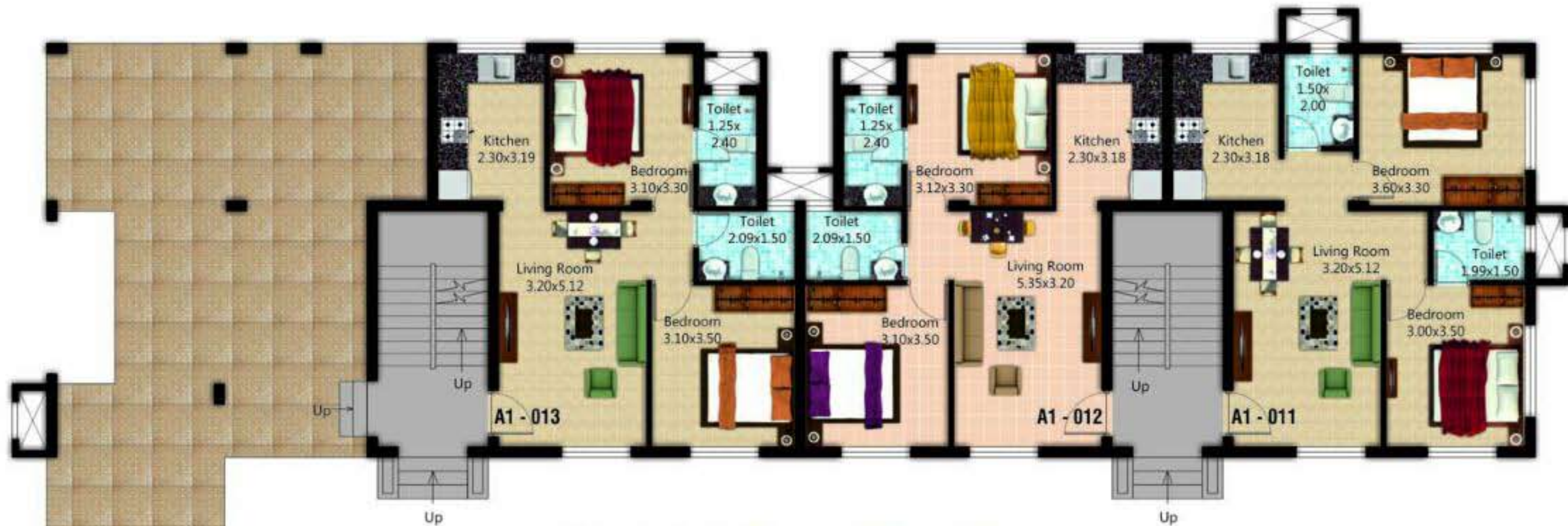
Block A 1- Ground Floor Plan